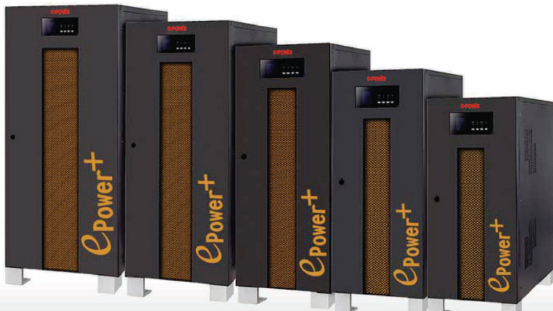
100K/120K 60K/80K 30K/40K 20K 10K/15K